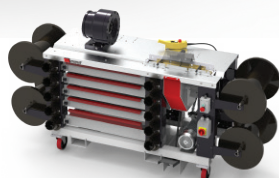
Version for hoses 2" Max.