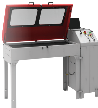
Model shown L